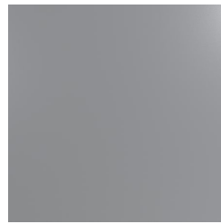
Core Powder-Coat Silver Pearl Satin Metallic