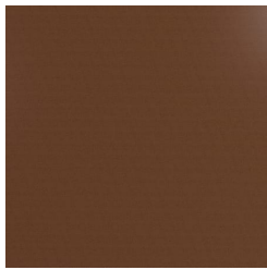
Core Powder-Coat Coreten Textured