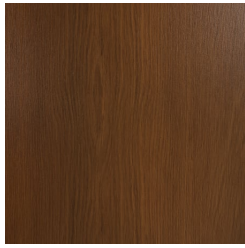
Hardwood Australian Eucalyptus Dark Oil