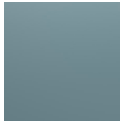
Signature Powder- Coat Wedgewood Satin