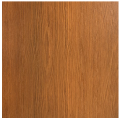
Hardwood Australian Eucalyptus Light Oil