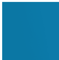
Bold Powder-Coat Sky Blue Satin