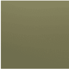
Signature Powder- Coat Mangrove Satin