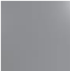
Core Powder-Coat Silver Pearl Satin Metallic