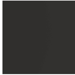
Core Powder-Coat Charcoal Satin