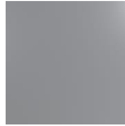
Core Powder-Coat Silver Pearl Satin Metallic