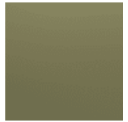
Signature Powder- Coat Mangrove Satin