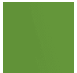
Bold Powder-coat Yellow Green Satin