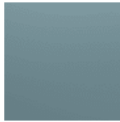
Signature Powder- Coat Wedgewood Satin