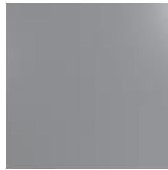
Core Powder-Coat Silver Pearl Satin Metallic