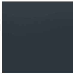
Signature Powder- Coat Deep Ocean Satin