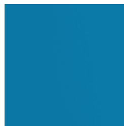
Bold Powder-Coat Sky Blue Satin