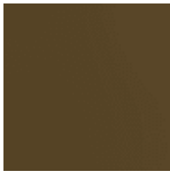
Core Powder-Coat Bronze Satin Metallic